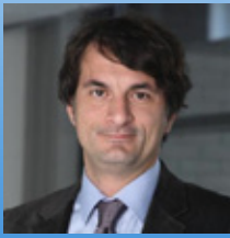
President SeENS Education Course