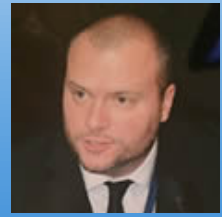
SeENS Vice President