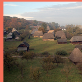
ETHNOGRAPHIC PARK OF CLUJ-NAPOCA