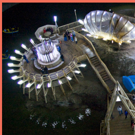
TURDA SALT MINE