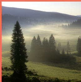
PADIS NATIONAL PARK