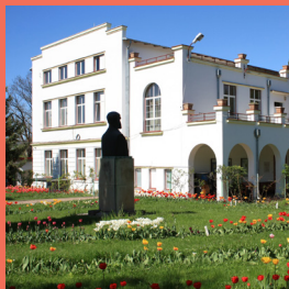
BOTANICAL GARDEN OF CLUJ-NAPOCA