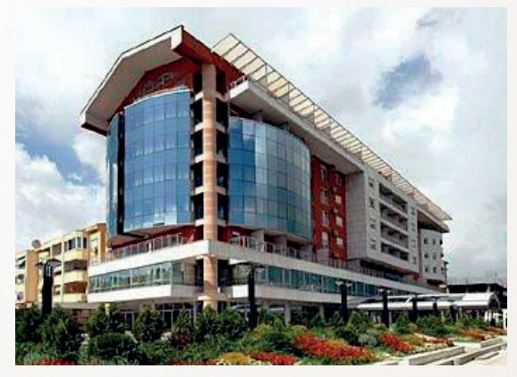
BEST WESTERN PREMIER HOTEL MONTENEGRO Svetog Petra Cetinjskog 145 Podgorica, Montenegro www.bestwestern-ce.com/montenegro