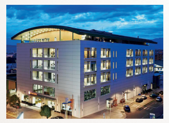
HOTEL RAMADA Save Kovačevića 74 Podgorica, Montenegro www.ramadapodgorica.me