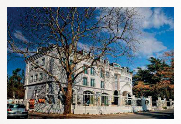
Hotel Ziya Beogradska 10 Podgorica, Montenegro www.hotel-ziya.me