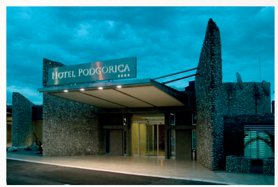
HOTEL PODGORICA Svetlane Kane Radević 1 Podgorica, Montenegro www.hotelpodgorica.co.me